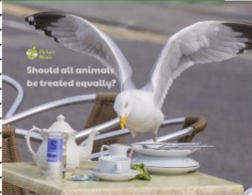
Should all animals be treated equally?