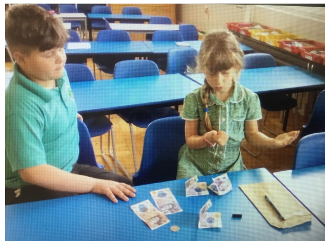
School Council starting the Skipathon