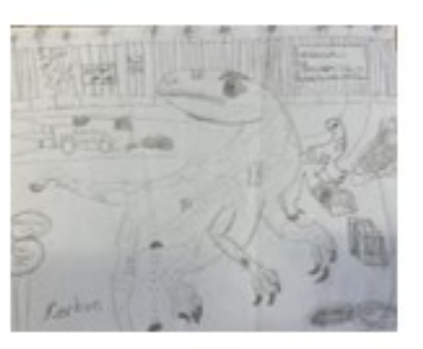
Corbyn (Year 5)