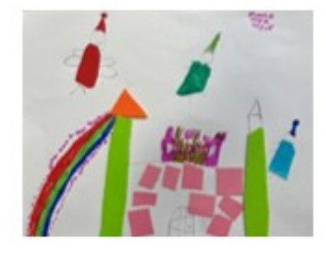
Phoebe (Year 2)