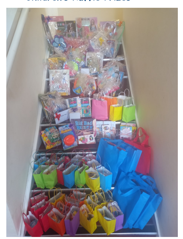
Children's Raffle Prizes