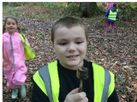
We all collected wood for the fire on the way, whittled sticks to finally toast marshmallows.