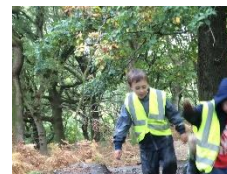
We discovered that water and soil make mud and it's fun to slip over. Wet clay sticks stones to trees.