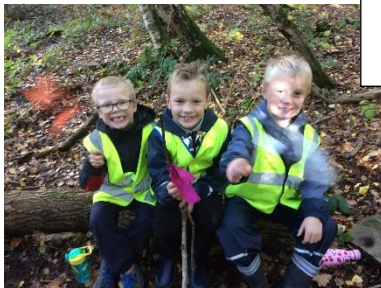
A game finding flags and making a group of 3 animals in a food chain.