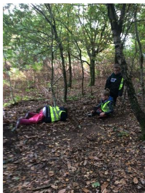
The children enjoyed a giant web assault course set up by Sycamore class and then added to it. Lots of careful moving.