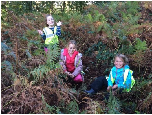
Various predator and prey animals were hidden around and children spotted and named them.