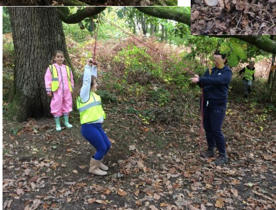
Swings were made every week in different ways on different trees and by different children.