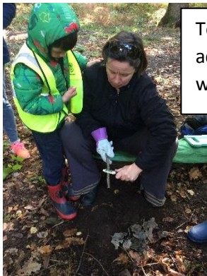
Teaching the adults how to whittle.