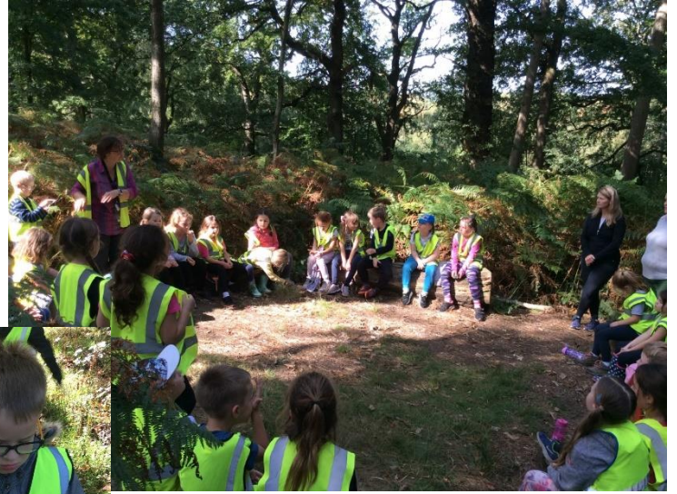
Beech Class Forest School Sept – Oct 2020. We climbed the tump, discovered Dor Beetles, Fly Agaric fungi, acorn craft, whittling and games.