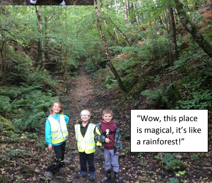
"Wow, this place is magical, it's like a rainforest!"