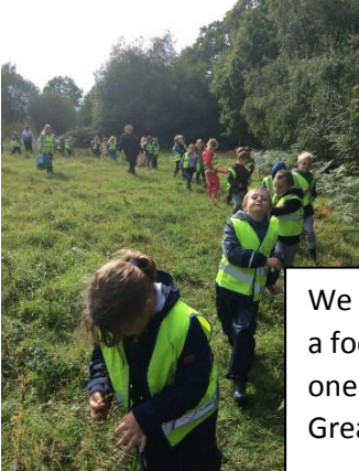
We were an ant colony on a food hunt and collected one item each to share. Great teamwork!