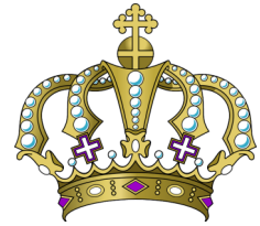
Year 5 pupils created formal invitations for the Royal Wedding this morning.