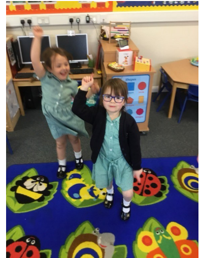
Oak Class enjoying some party games!